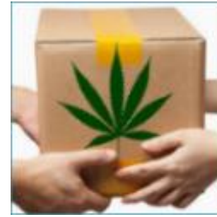
Delivery/ Non Storefront Retail