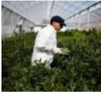
Indoor Commercial Cultivation